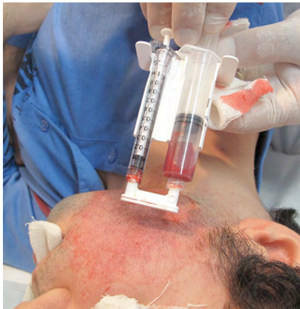
Figure 1. Platelet-rich plasma application.

median is zero [ P(+)=P(-) ]; and differences' median is negative [ P(+)<P(-) ] ( \alpha=.05 ). The result is calculated by computing the binomial probability.