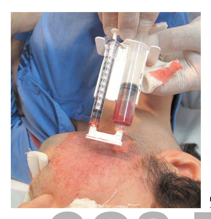
Figure 1. Platelet-rich plasma application.

median is zero [P(+)=P(-)]; and differences' median is negative [P(+)< P(-)] ( \alpha =.05). The result is calculated by computing the binomial probability.