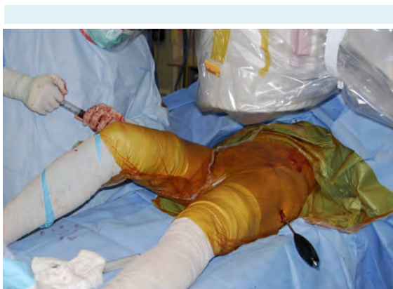
FIGURE 3. Injection of bone marrow concentrate into the area of necrosis (published with permission from Sierra RJ). Alternative procedure for osteonecrosis of the femoral head, Figure 4 (24).

At this time, the contents of the bone marrow concentrate and the platelet-rich plasma have completed the centrifugation process. Approximately 12 mL of each should be obtained. They are combined in a 30 mL-syringe in a sterile manner. This can be doubled if both hips are to be injected. The contents of the 30 mL-syringe are then injected into the trochar, which should be positioned in the necrotic lesion of the femoral head. Due to the sclerotic nature of the lesions, it may require significant pressure to inject the contents from the syringe (Figure 3). If excessive resistance is met, the trochar can be retracted while confirming that the tip remains in the area of necrosis. This will increase the space available to inject while ensuring that the mesenchymal stems cells are delivered to the cor-