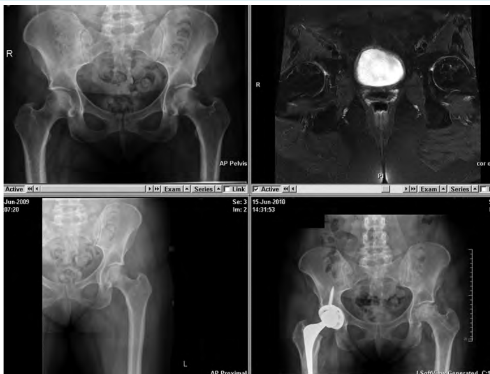
FIGURE 4. A 43-year-old female on steroids for cancer treatment presents with bilateral hip involvement. Upper left: anteroposterior (AP) pelvis radiograph taken on presentation. Lower left: AP of the left femur taken on presentation. Upper right: T2 coronal oblique MRI showing significant bilateral head involvement prior to treatment. Lower right: AP pelvis shows complete collapse of the left femoral head resulting in total hip arthroplasty 1 year post-operative.

The original work by Hernigou was a retrospective study that popularized the addition of bone marrow concentrate to a core decompression (22). The information obtained from the study have been proven very beneficial in identifying the procedure and etiologic data, however the study did not compare the results with core decompression in a prospective manner. Since this study, at least 4 studies have prospectively compared the results of standard core decompression and core decompression with autologous bone marrow introduction.