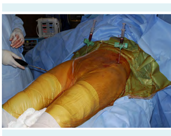
FIGURE 1. Patient with iliac crest aspirators in place, with bilateral hips prepared for decompression and injection of concentrated bone marrow (published with permission from Sierra RJ). Alternative procedure for osteonecrosis of the femoral head, Figure 2 (24).

The patient is placed supine on a radiolucent table and general anesthesia is performed. Fluoroscopic imaging is used at this time to ensure that adequate anterior-posterior (AP) and frog-leg lateral images can be obtained with the patient's position. The operative hip/hips and both iliac crests are prepped and draped into the surgical field in a sterile manner (Figure 1). Two grams of cefazolin should be given at this time. The procedure begins by obtaining iliac bone marrow aspirate. A 2-3-mm incision is made over that anterior aspect of each anterior iliac crest. When the iliac crest is visible, the trochar (Marrowstim, Biomet Biologics, Warsaw, IN, USA) can be inserted into the iliac crest in between the two tables of ilium and bone marrow can be aspirated into 10 mL-syringes. We use the Bio-Cue System (Biomet Biologics) to concentrate the bone marrow aspirate obtained. Each vial requires 57 mL of bone marrow aspirate mixed with 3 mL of heparin to prevent clot formation. A single vial produces 6 mL of concentrated bone marrow aspirate, and we typically utilize two vials per hip. Once collected, the vials are placed in a centrifuge for 15 minutes to adequately concentrate the mononuclear fraction of blood that contains the mesenchymal progenitor cells. Additionally, 120 mL of anticoagulated blood are placed into two