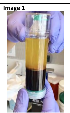
XCELL PRP Concentration Device after centrifuge separation of blood fractions.

driven upward through the device propelling the fractions into a collecting syringe which has been attached to the top of the XCELL device. The user can choose the volume of PPP to remove, and subsequently the volume of enriched plasma, buffy coat and/or RBC appropriate for the desired concentrate. In this study, the PPP syringe was replaced with a 10mL syringe, and a total volume of 6-7mL was collected including the first ~100ul of RBC observed entering the tip of the syringe (Image 3). All PRP samples were sent to an independent laboratory (Intermountain Health Care, Central Laboratory, Murray, UT, USA) for characterization of RBC, WBC and platelets. The average composition of Low-Leukocyte PRP (LL-PRP) is provided in Table 1.