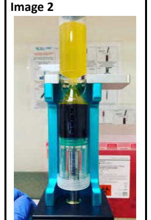
ABBP allows precise separation of the blood fractions.