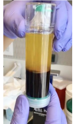
XCELL PRP Concentration Device after centrifuge separation of blood fractions.