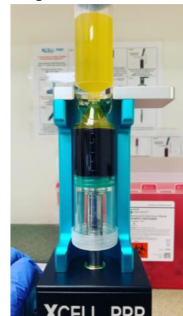
ABBP allows precise separation of the blood fractions.